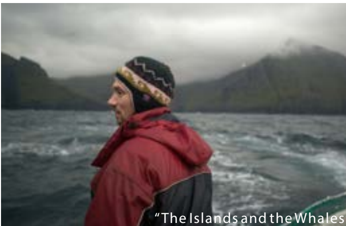
"The Islands and the Whales"

Chasing Coral COSMOS: A SpaceTime Odyssey Dangerous Exposure Hell and High Water The Islands and the Whales Virunga Gardeners of Eden Get Real: Heart of the Haze Planet Earth II